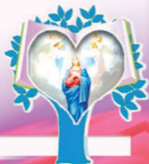
5 th Glorious Mystery - Mary is Crowned

20 We pray for dignity of women to be safeguarded and free from all harassment.