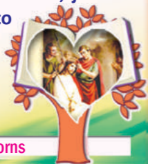
3 rd Sorrowful Mystery - The Crowning With Thorns

13 We pray for all desperate persons due to debts, exam-failures, crop-failures, job failures, love-failures etc., to look beyond problems and sufferings to experience the protection of God.