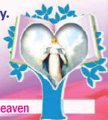
4 th Glorious Mystery - Mary is taken up into Heaven

19 We pray for all Priests, Religious and Laity to work together to build a strong spiritual community.