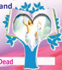
1 st Glorious Mystery - Jesus Rises from the Dead

16 We pray for all the victims of severe flood in Kerala to experience rebuilding of life through the mercy of God and human solidarity.