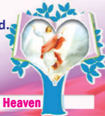
2 nd Glorious Mystery - Jesus Ascends to Heaven

17 We pray that the humanity may grow strong in the knowledge of the second coming of Christ and live according to the will of God.