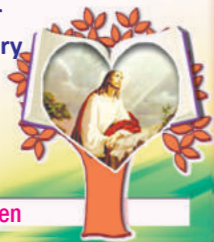
1 st Sorrowful Mystery - The Agony in the Garden

11 We pray for peace and harmony free from moral degradation, wars, natural calamities, accidents and epidemics as we surrender to the Immaculate Heart of Mary the whole world.