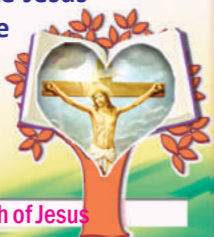
5 th Sorrowful Mystery - The Crucifixion & Death of Jesus

15 We pray for all persecuted people that they may forgive one another like Jesus on the Cross and experience peace.