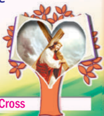
4 th Sorrowful Mystery - The Carrying of the Cross

14 We pray for all humanity that they may have air, food and water free from poison.