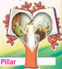
2 nd Sorrowful Mystery - The Scourging at the Pillar

12 We pray for the Lord's mercy and help to cure Cancer and Aids Patients to prevent these deadly diseases from spreading in the world.