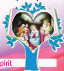
3 rd Glorious Mystery - Descent of the Holy Spirit

18 We pray for all Christian parents to bring up their children in spiritual life by daily family prayers and Rosary.